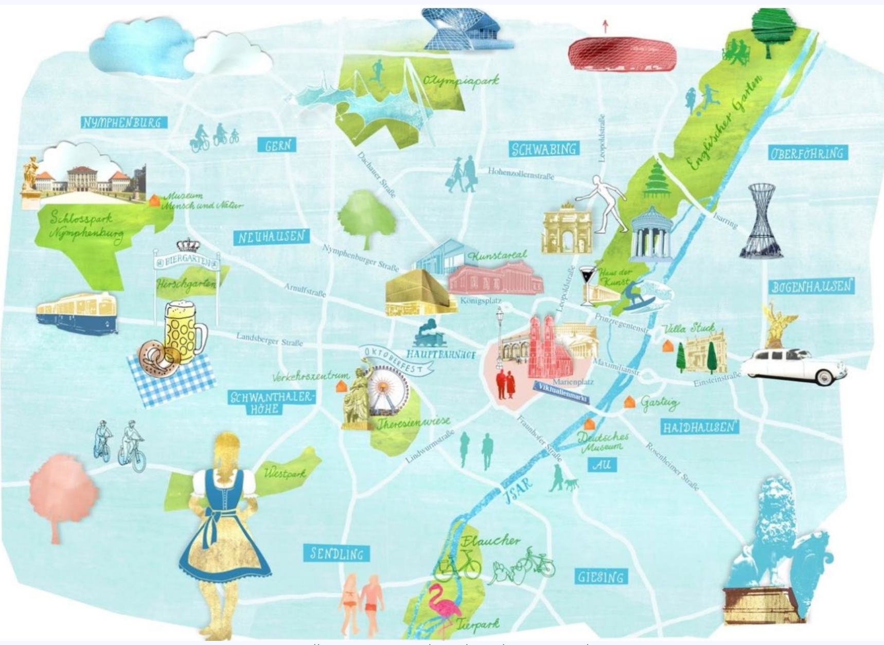
Simply Munich: <u>https://www.munich.travel/en-gb/topics/urban-districts/classical-and-curious</u>

www.munich.travel/engb/categories/discover/urbandistricts/districts-of-munich