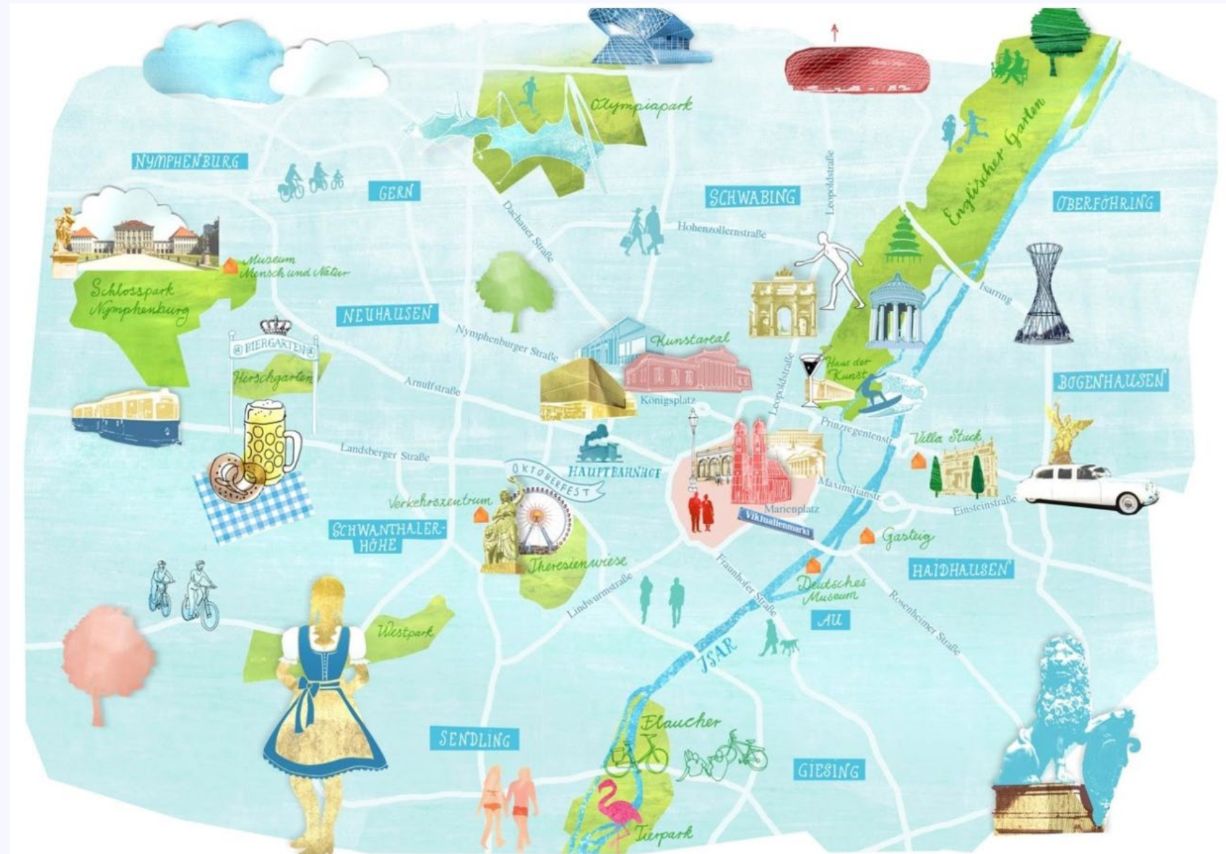
Simply Munich: https://www.munich.travel/en-gb/topics/urban-districts/classical-and-curious

www.munich.travel/en-gb/categories/discover/urban-districts/districts-of-munich